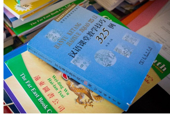
Textbooks (Gr 6-12)