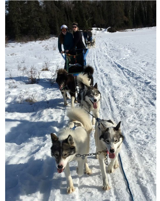
Winterim (Gr 9-12)