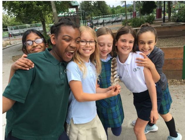
Uniforms (PK – Grade 5)