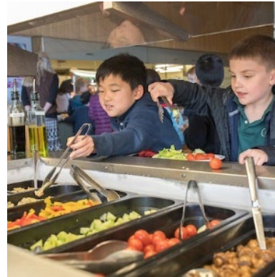
Lunch & Snacks