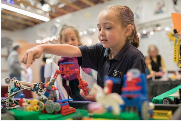
Extension (PK – Grade 5)