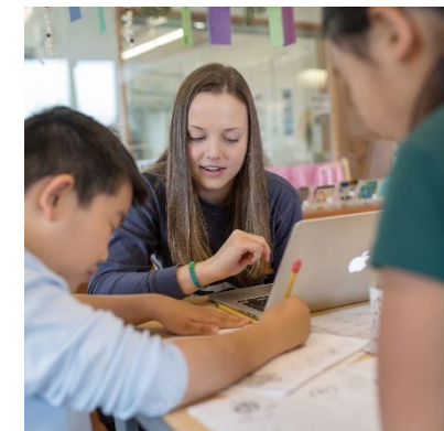
School Supplies (PK – 5)