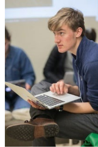
Laptop (Gr 9-12)