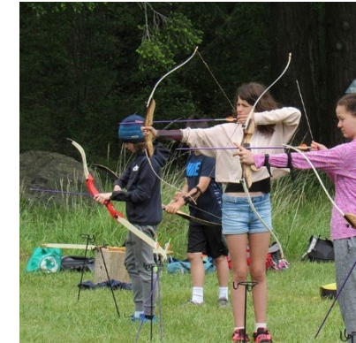
Field Trips & Outdoor Education