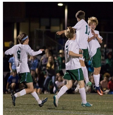
Most Athletics (6-12)