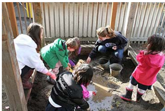
An Octoberim activity with Upper and Lower School students